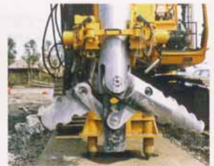
Machine with Opening Wings