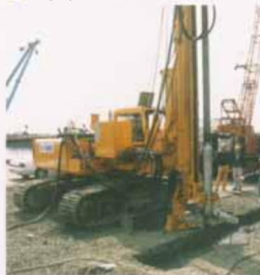
Machine used for Treatment