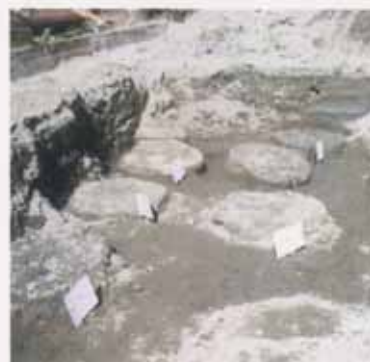
Improvement in Progress